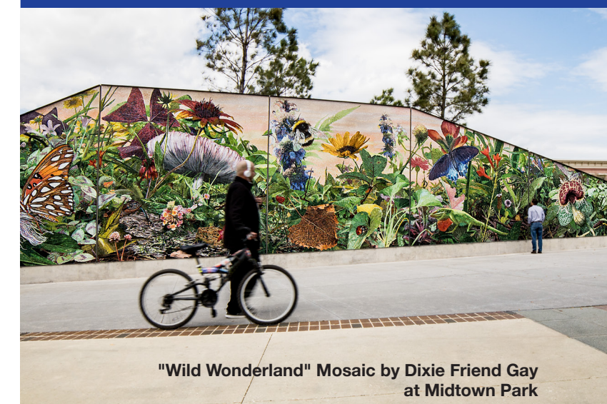
"Wild Wonderland" Mosaic by Dixie Friend Gay at Midtown Park