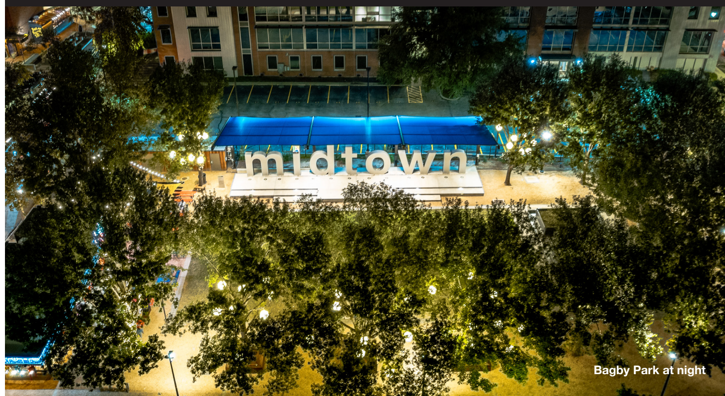
Bagby Park at night

To find out more about the project go to huemanshelter.com