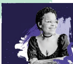
Cam Shot First Milam & Webster St.